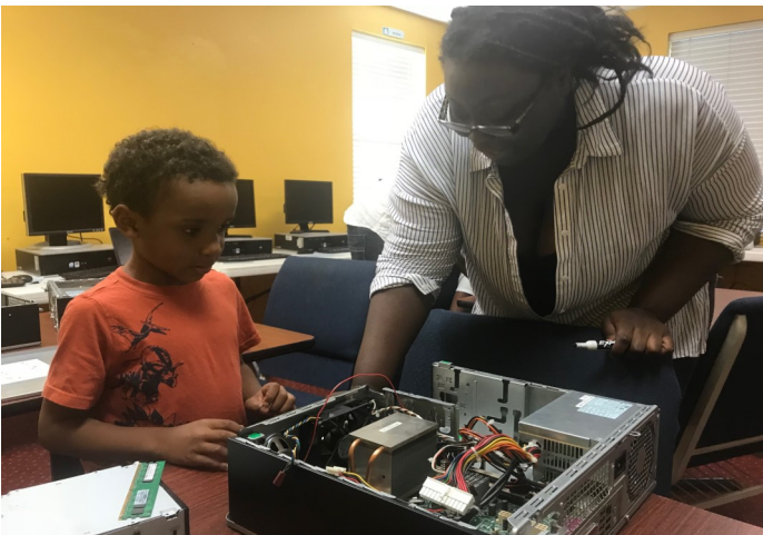
Building Computers in Tech Class