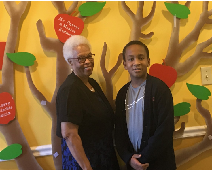
Grandparent/Special Seniors Day