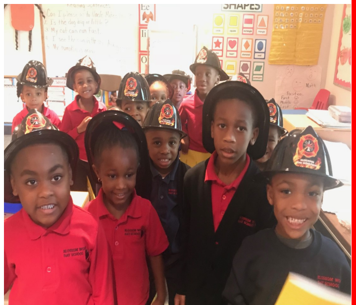
Fire Day with Hazelwood Fire Department