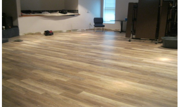
Auditorium hardwood floor installation