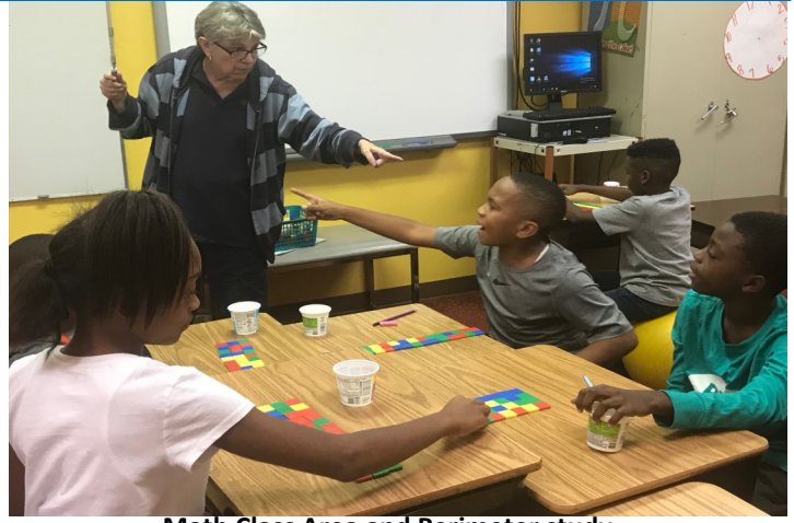
Math Class Area and Perimeter study