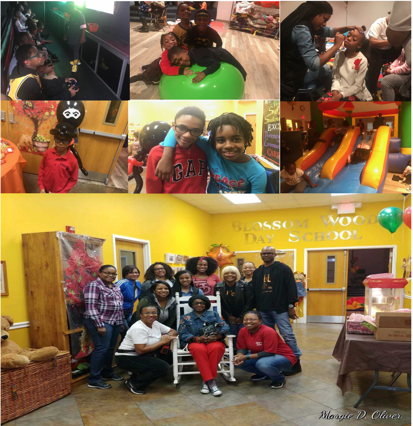
Fall Festival Parent Committee