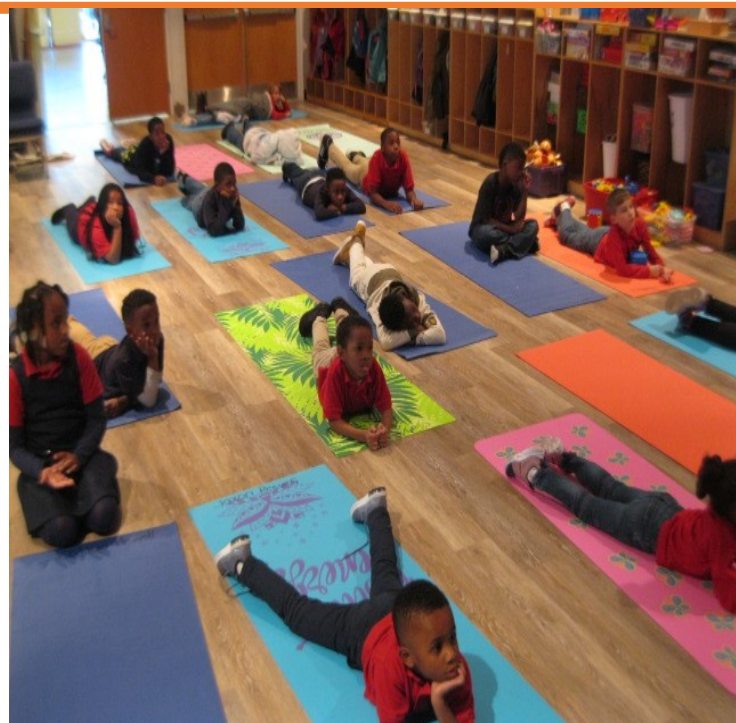
Yoga Mat donations from three families make us comfy!