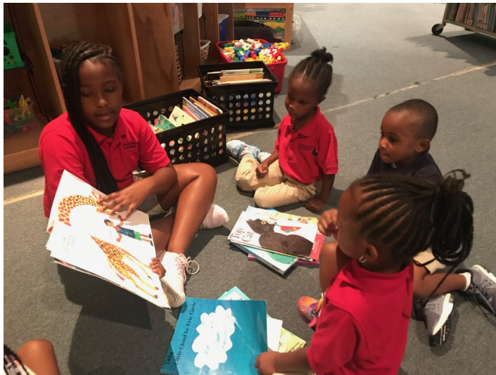
Sharing our love for Reading