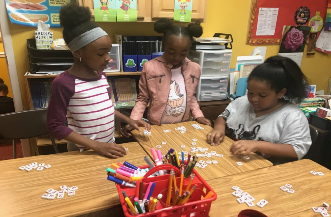
Math Skills in Math Drills Class