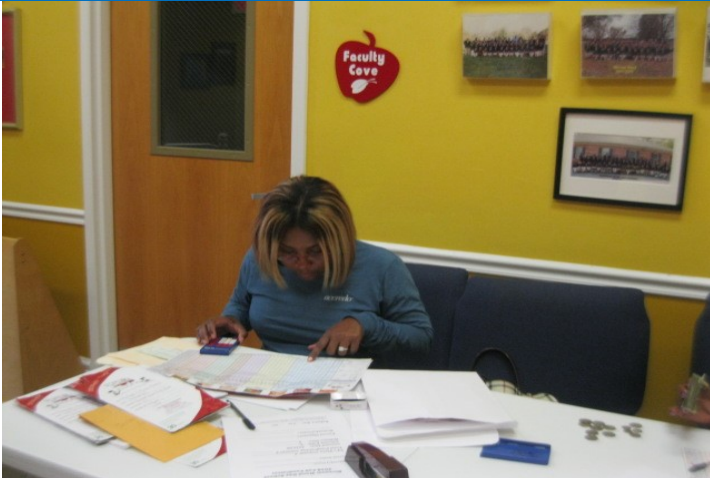
Parent Volunteering for TJ's Pizza Fundraiser